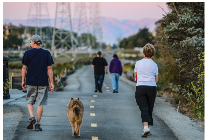
Example of a multimodal trail