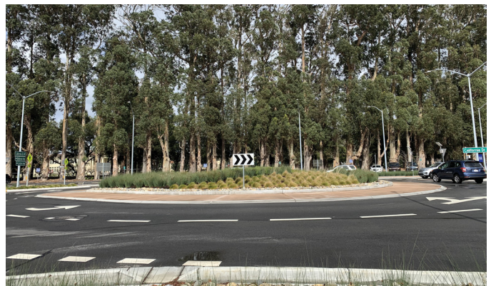
Example of roundabout in Burlingame, CA