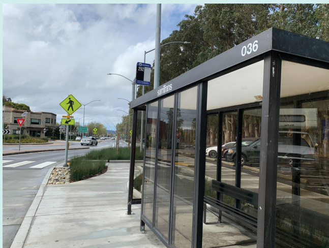
Bus Stop Shelter